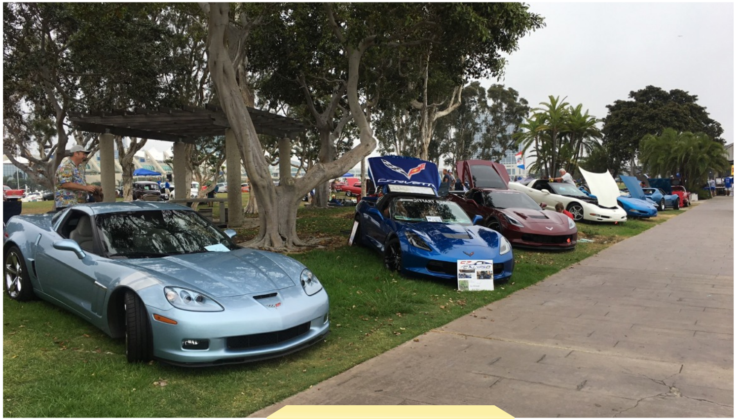
Main Street America